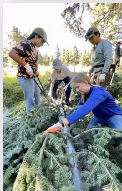
Students from El Dorado High School's Natural Resources Program help to build a beaver dam analog at Leek Springs Meadow under the supervision of staff from Symbiotic Restoration.

Another group of high schoolers from across the state visited our property at Wells Preserve as part of the Forestry Challenge. Over 120 high school students representing 17 schools spent two days learning the basics of forestry, timber cruising, and land management before conducting their own surveys. Data was compiled, and the teams spent another day planning their recommendations for how to manage the property and then presenting their proposals to a panel of judges from across