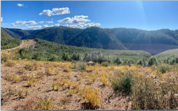
Otter Creek Canyon

El Dorado Ranch Over the last 11 years, ARC has protected 4,182 acres of El Dorado Ranch in 4 different phases. We are now working with the landowner to purchase and permanently protect the remaining 3,000 acres of this beautiful oak woodland landscape along the Cosumnes River in El Dorado County. Once the site of a planned residential development, El Dorado Ranch will become a unit in El Dorado County's first Wildlife Area – a special designation by California Department of Fish and Wildlife that allows for non-motorized wildlife-related recreation. This ambitious final phase of the acquisition will require strong support from our community. We hope you'll join us in making this project happen! Visit www.arconservancy.org/eldoradoranch to learn more and donate to this exciting project.