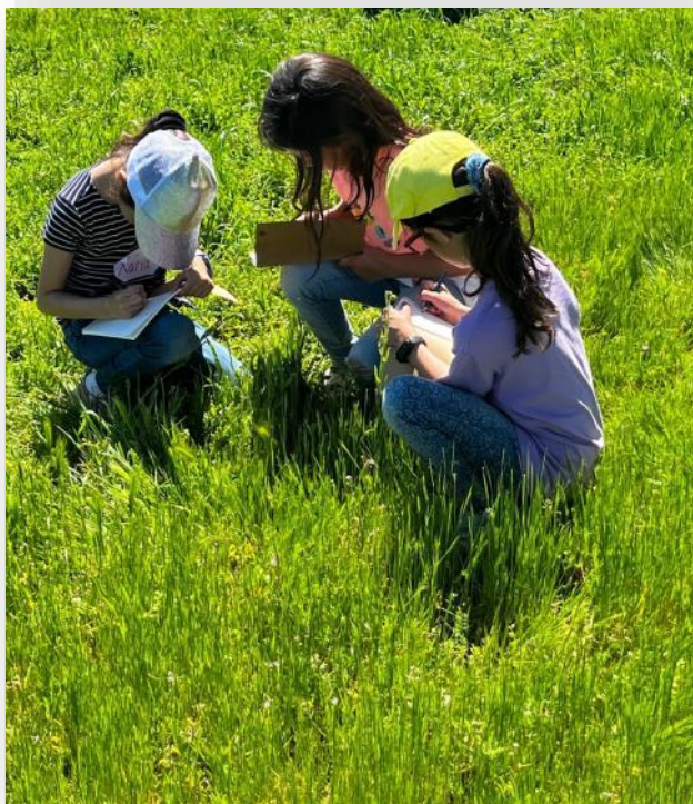
Students from a local school spend time nature journaling in the native plant garden at Wakamatsu Farm

Please keep an eye out for registration information in January.