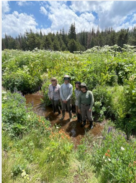
Symbiotic Crew and ARC Staff standing in incised stream channel at Leek Springs Meadow

The American River Conservancy is a vital force in land stewardship, effectively protecting, monitoring, and restoring the landscapes of the American and Cosumnes River Watersheds. Through dedicated efforts in forest and meadow restoration, alongside the invaluable contributions of passionate volunteers, ARC enhances the ecological health of the region while fostering a community deeply connected to its natural wealth. As we look to the future, we are committed to ensuring that the beauty and Integrity of the land is preserved for generations to come.