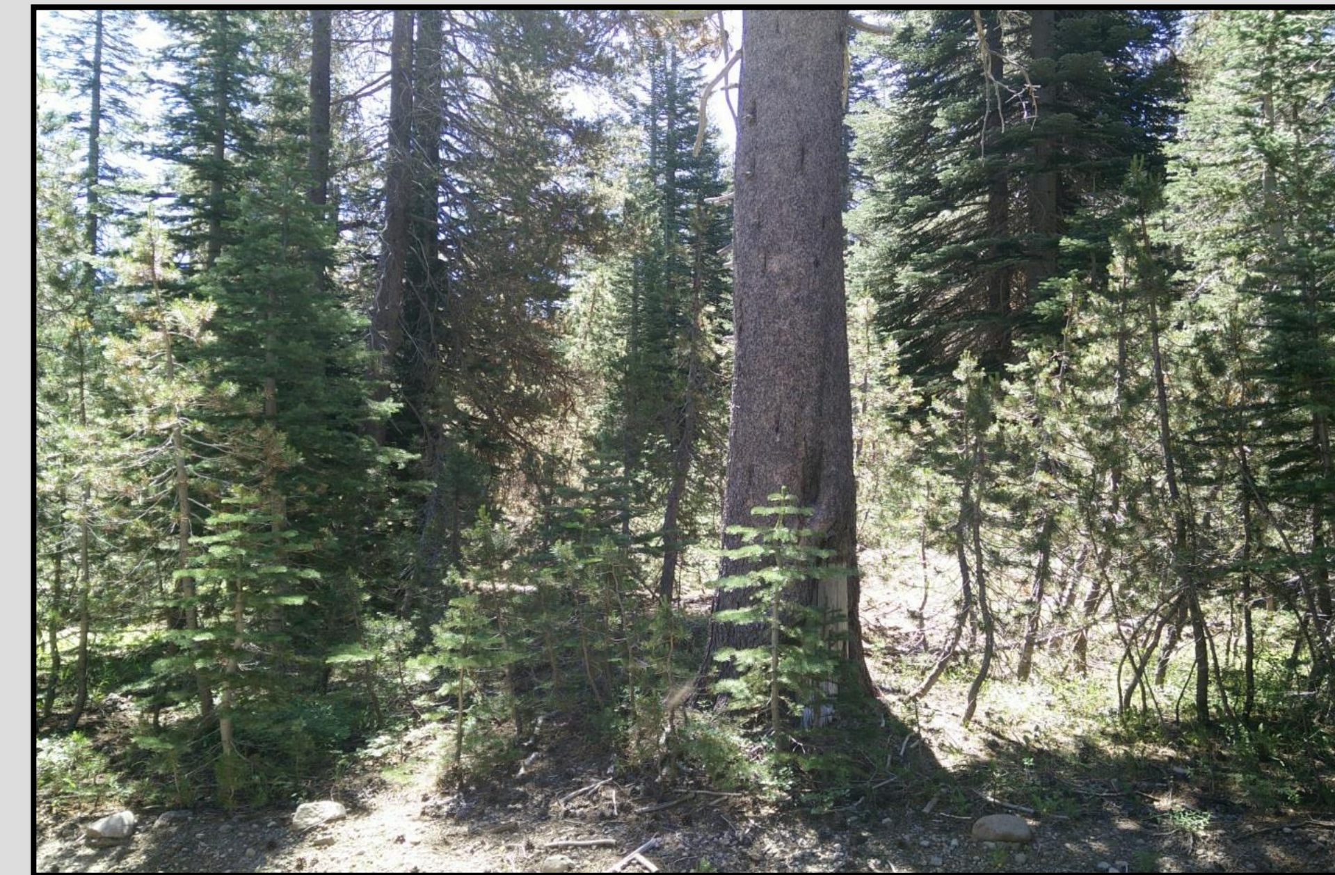
Figure 3. Before the removal of mid-story, understory and selective harvest of merchantable timber.