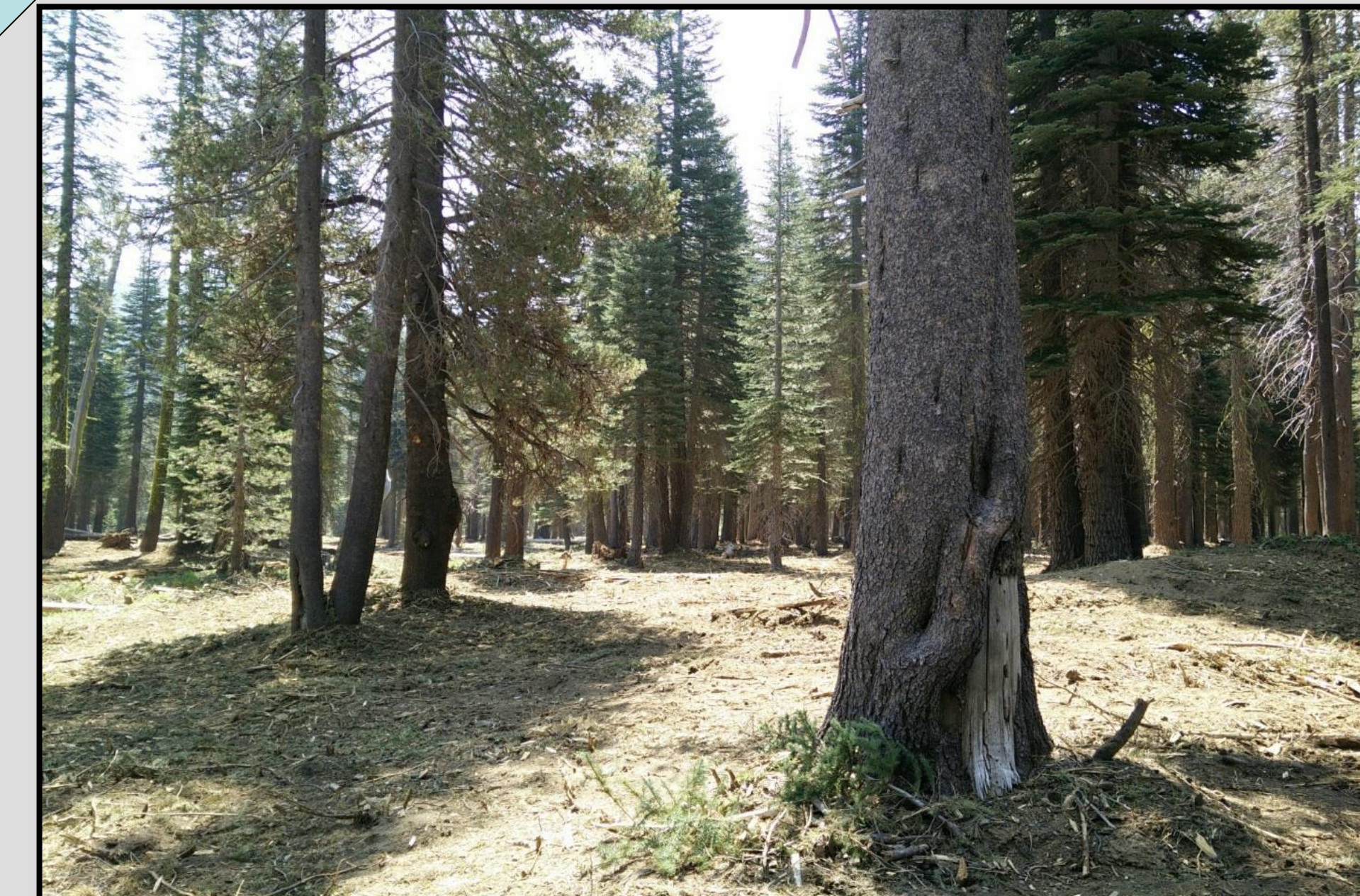
Figure 4. After the removal of mid-story and understory vegetation with the selective harvest of merchantable trees to achieve optimal spacing between individual stems and create openings in the canopy. This significantly reduces the fuel load, fire intensity and the vertical transfer of fire from surface to canopy fuels. This is often the prelude to reintroducing prescribed fire and natural fire return.