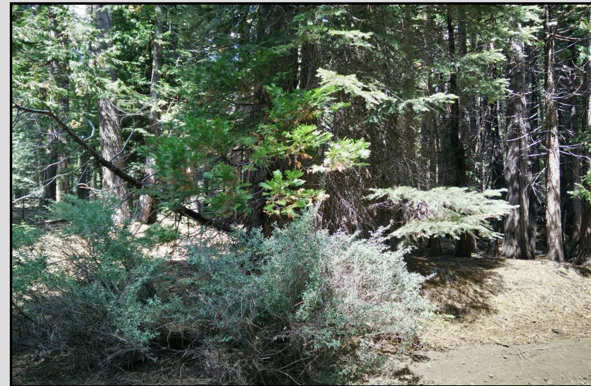
Figure 1. Before –Unhealthy and fire suppressed, pre-thinning stand conditions at the ARHRP. 76% canopy closure and 1,333 trees per acre.

Watershed Research: The Sierra Nevada Research Institute is leading research to quantify the link between forest health, thinning activities and water supply benefits.