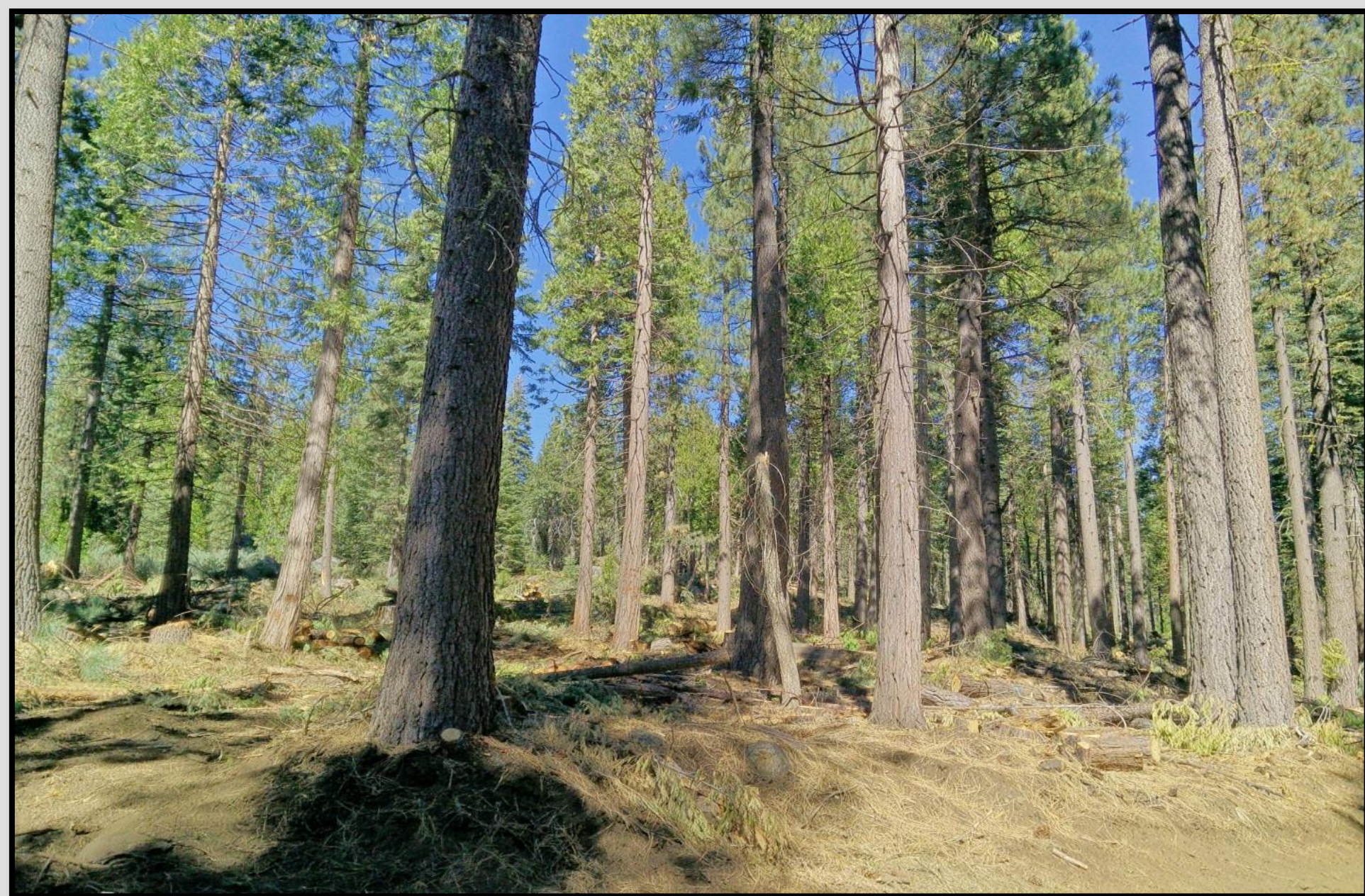
Figure 2. After - Ecologically managed post-thinning stand conditions at the ARHRP. 43% canopy closure and 157 Trees per acre.