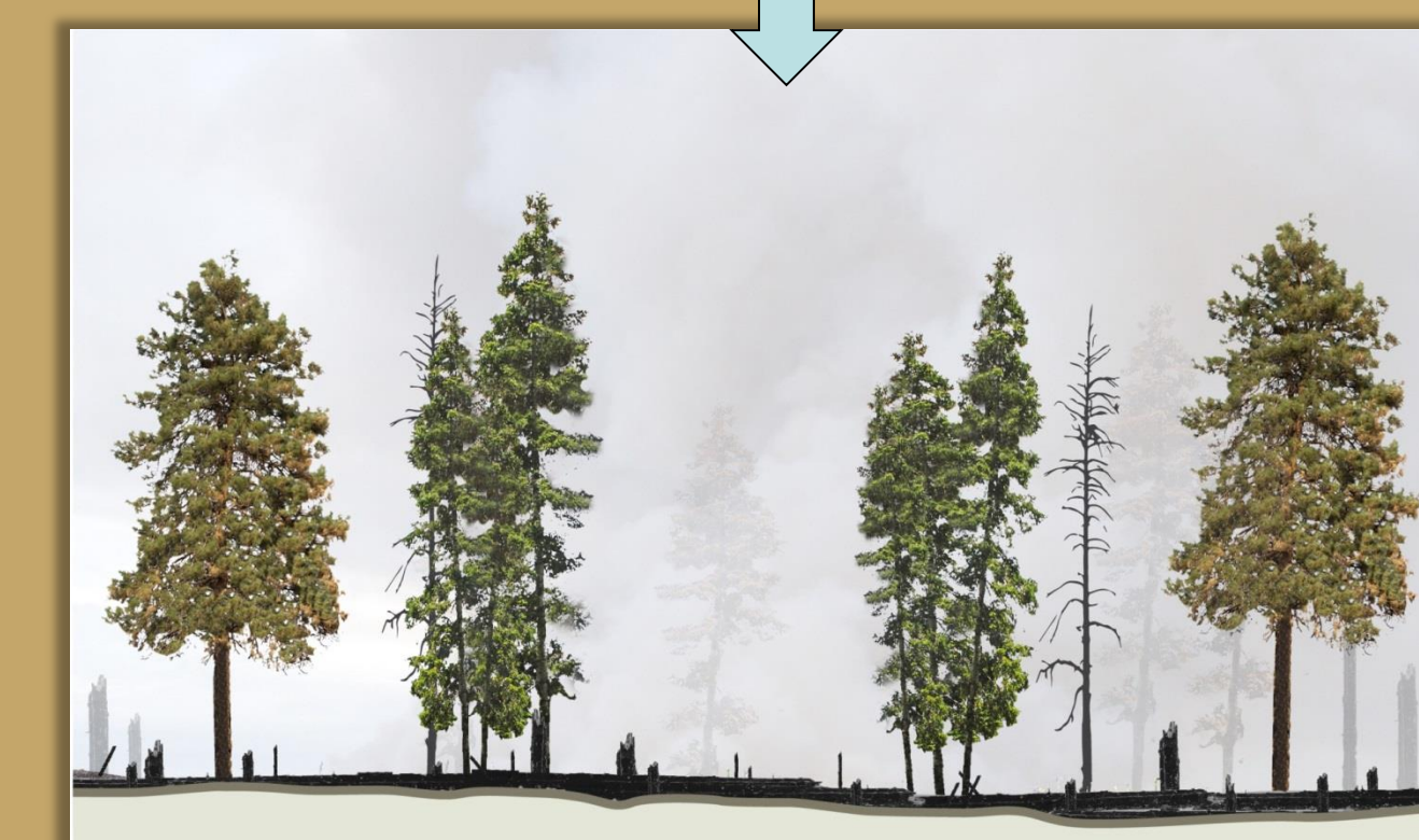
Figure 5. Ecological Thinning of the understory and mid-story vegetation can reduce fuel load so prescribed fire can be safely reintroduced. Moderate to low severity fire is a natural ecosystem process that maintains healthy forests.